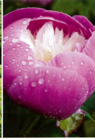
OPPOSITE: Colorful blooms and a pretty trellis enhance the home's brick facade. THIS PAGE: A fieldstone walkway leads to a path through a natural woodland landscape. Large perennial beds filled with traditional favorites like peonies surround the home and its outdoor entertaining areas. The pool house/greenhouse fills a dual role for tending garden and guests.